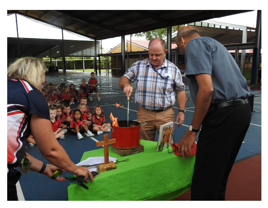
Ash Wednesday Ceremony

The Enrolment policy takes into account and is in accordance with Brisbane Catholic Education Administration Handbook Guidelines regarding the Enrolment of Students.