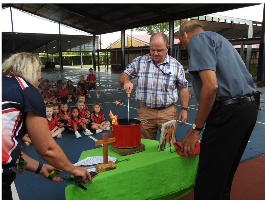
Ash Wednesday Ceremony

The Enrolment policy takes into account and is in accordance with Brisbane Catholic Education Administration Handbook Guidelines regarding the Enrolment of Students.